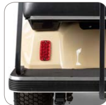
LED Tail Lights and Turn Signals standard