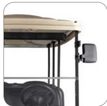
Multiple options available to enhance style and comfort