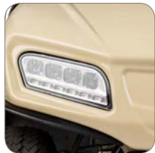
LED Headlights with Daytime Running Lamps standard

The new Villager includes safety-enhancing features such as LED headlights (with daytime running lamps), a four-wheel braking system, turn signals, tail/brake lights, and a horn to ensure that your guests arrive safely.